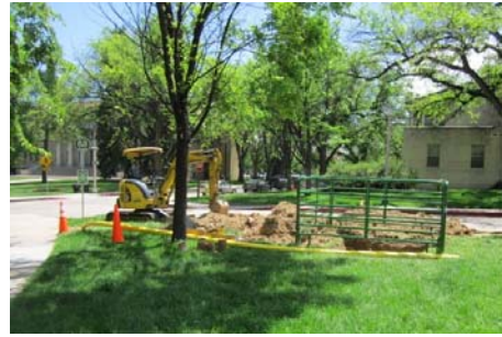
CSU Gas Line Replacement

Colorado State University (CSU) is currently upgrading aged infrastructure on their main campus through the State's Controlled Maintenance Program. Ditesco is assisting with the design and construction of these improvements, which include the replacement of 4,800 lineal feet of natural gas main and 3,200 lineal feet of aged cast iron waterline. In addition to increasing operability and longevity for CSU, sections of the pipelines will serve increased demand from new buildings. Construction is scheduled to be completed by the end of the summer to minimize impacts to students.