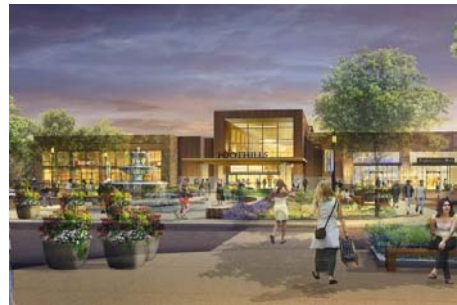
Foothills Mall Rendering

Walton Street Capital IV in partnership with Alberta Development and the City of Fort Collins Urban Renewal Authority are redeveloping the Foothills Fashion Mall. This revitalization and renewal of Midtown Fort Collins is essential to the long term viability and success of our urban core. The project includes over 600,000 square feet of retail space, community gathering spaces, residential housing, a new Cinemark XD digital theater, pedestrian underpass and Foothills Activity Center. Ditesco is fortunate to help with this essential community project providing oversight project management.