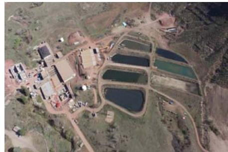
Loveland Water Treatment Plant

Chasteen's Grove Water Treatment Plant is undertaking an 8MGD expansion to provide for Loveland's needs now and into the future. The expansion includes construction of new chemical, filter, polymer, and fire pump/soda ash buildings, sampling station and four filter drying beds. The project also includes demolition of old structures and modification of existing structures to accommodate improvements. Ditesco is providing construction/project management and resident engineering services to ensure the upgrades meet the City's requirements for improved process and water quality.